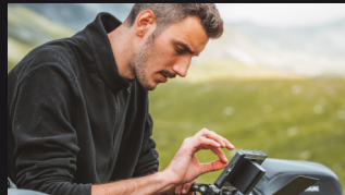
Photo and video shoots designed specifically for social media , websites , and marketing campaigns. Every piece of content is crafted to be emotional , consistent, and visually impactful .